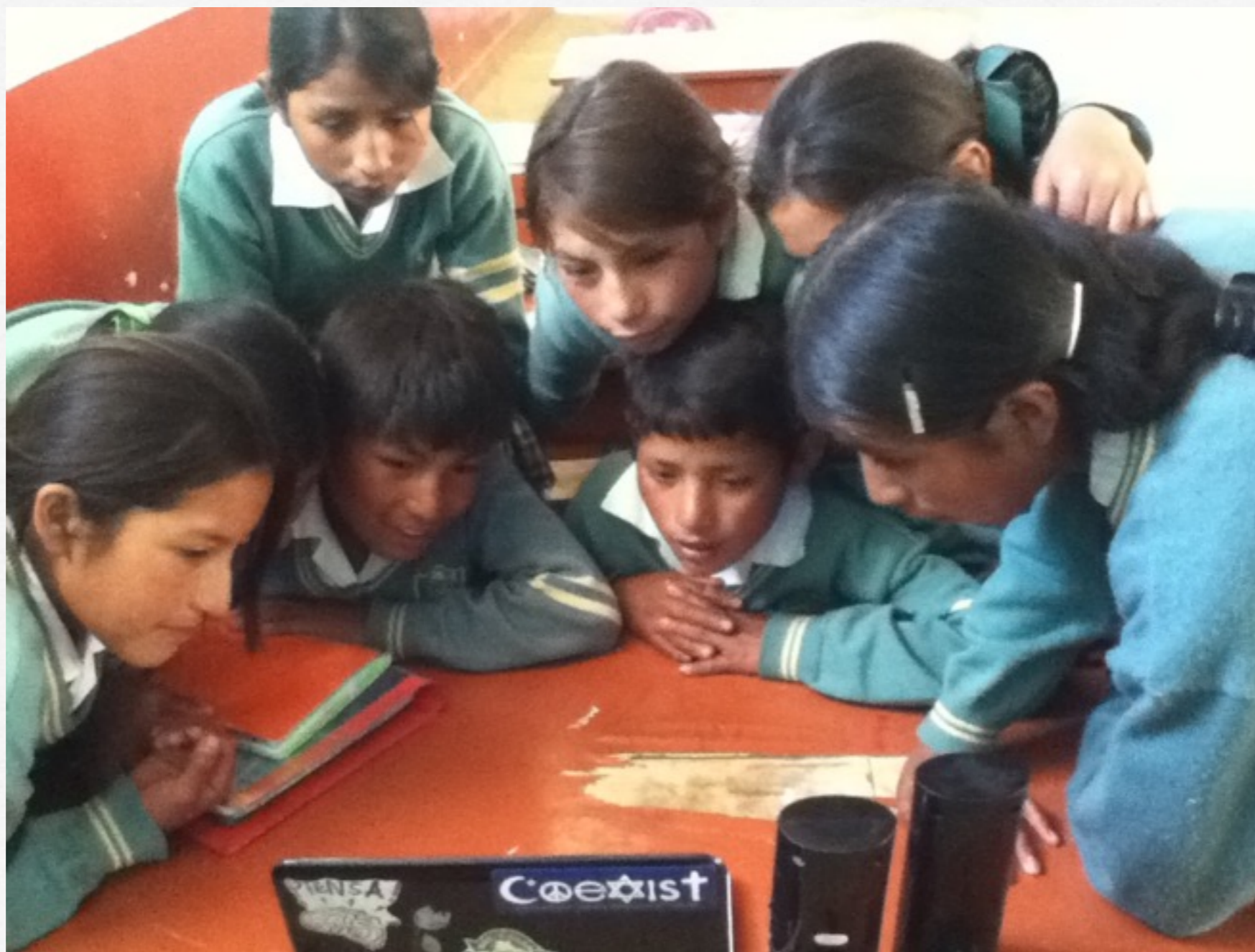
Students in Peru watching USA Introduction video